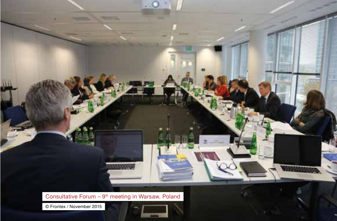
Consultative Forum – 9 th meeting in Warsaw, Poland