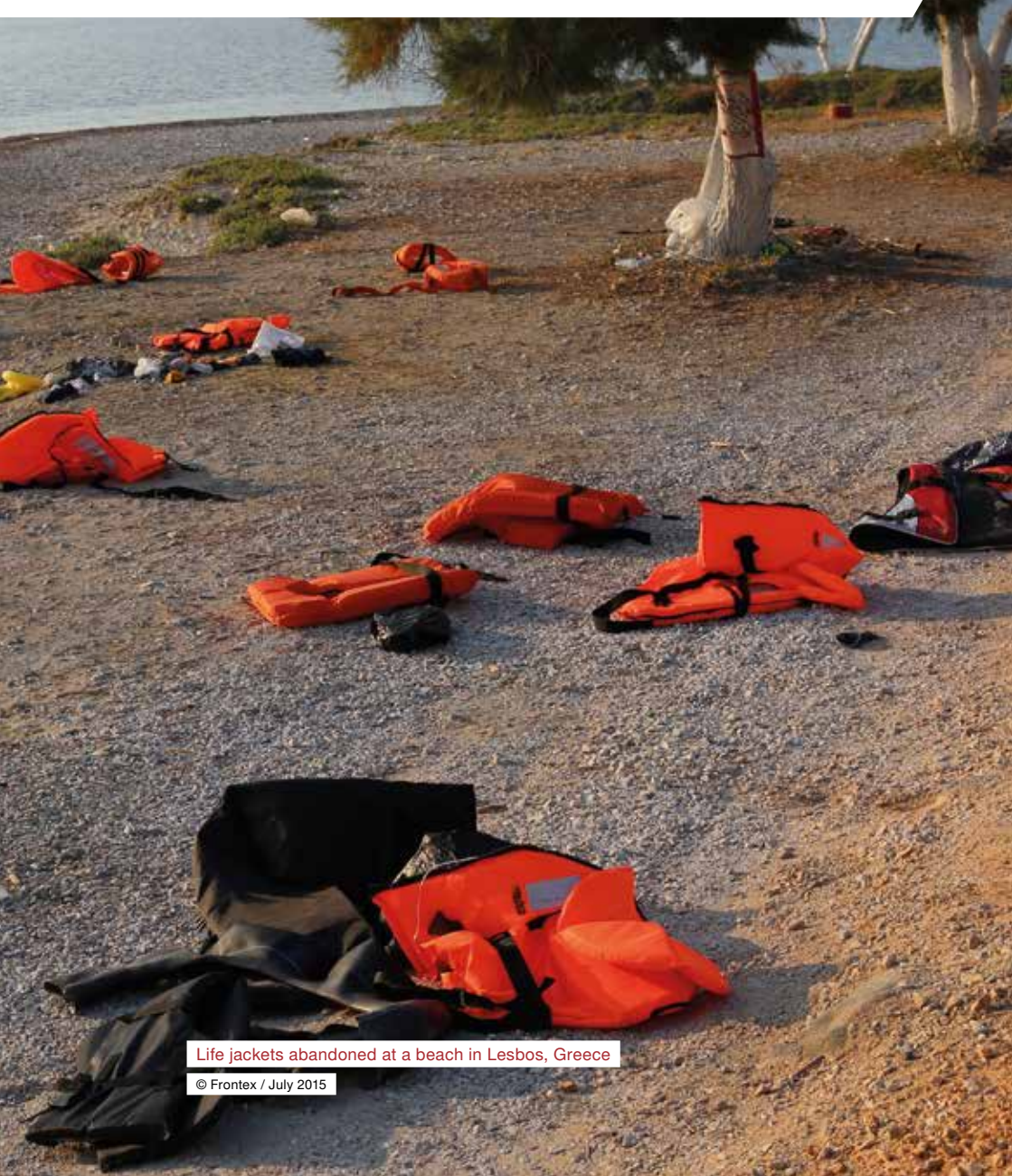
Life jackets abandoned at a beach in Lesbos, Greece