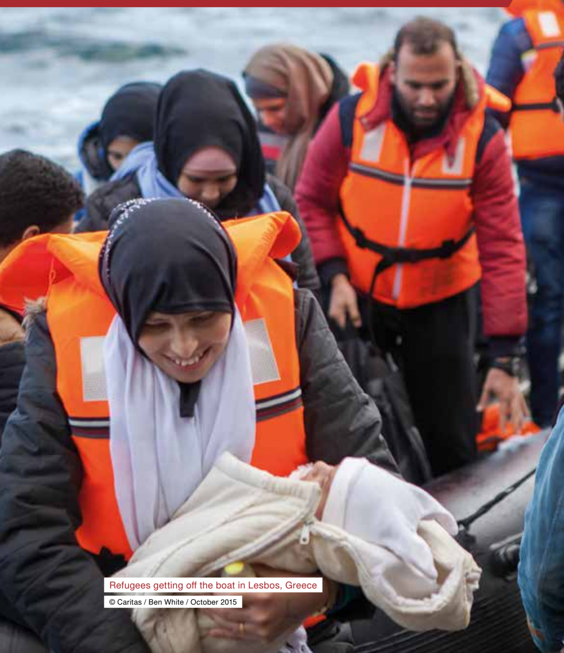
Refugees getting off the boat in Lesbos, Greece