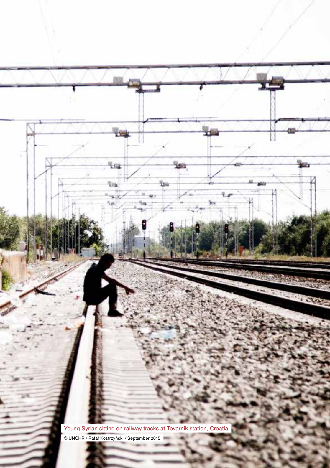
Young Syrian sitting on railway tracks at Tovarnik station, Croatia

© UNCHR / Rafał Kostrzyński / September 2015