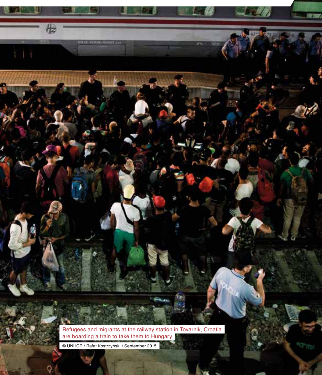
Refugees and migrants at the railway station in Tovarnik, Croatia are boarding a train to take them to Hungary