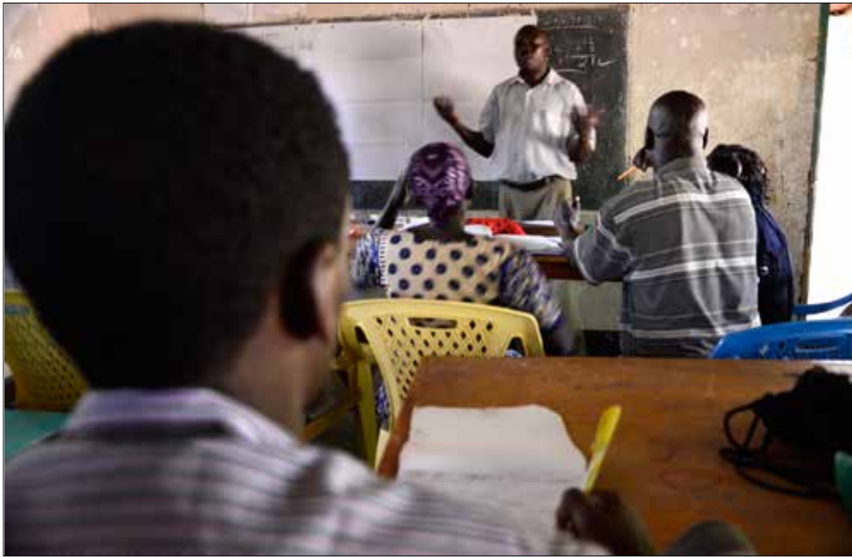
An adult education class for refugees in Kenya's Kakuma camp.

forced to work informally and, in some cases, submit to exploitative labor conditions in order to survive.