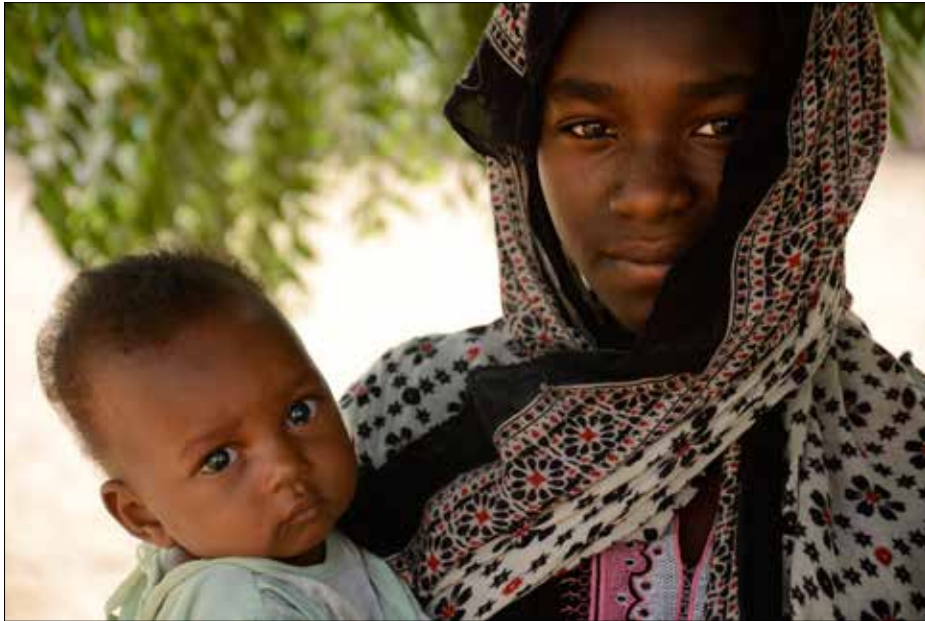
JRS works to ensure women with children have access to school.

their children. And, on the other hand, individuals are discouraged about completing their education when there are no opportunities for employment.