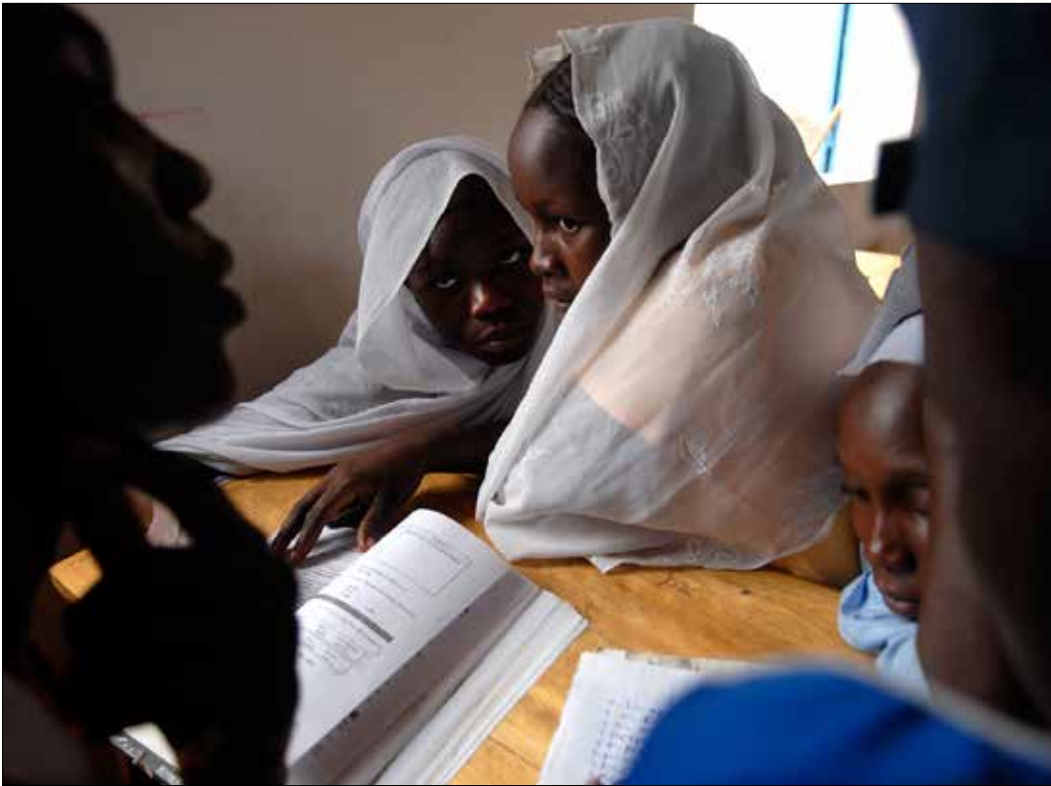
Students share a text book in Chad's Djabal refugee camp.

refugee status, expenses are not covered. This includes fees for tuition, school uniforms, books and transportation which are impediments to their education. In Kenya, lack of host country recognition of student qualifications from their home countries poses another barrier to access. In Uganda, while there are no real restrictions for displaced students to enter school and refugees are able to work and contribute financially to education-related costs, JRS staff report that school credits from refugee home countries are rarely recognized.